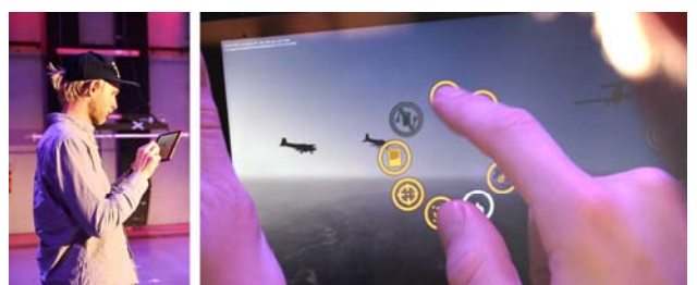
Figure 2: Director using VPET (left). User Interface (right).

VPET is an application for tablets running Android, Windows or iOS and has been developed based on the Unity engine to explore possibilities for collaborative on-set editing of virtual content. Users can grab a tablet at the film set and start exploring and editing the virtual content, performing simple edit tasks of the virtual elements of the shot in a fast and intuitive way directly on set (Figure 2, left).