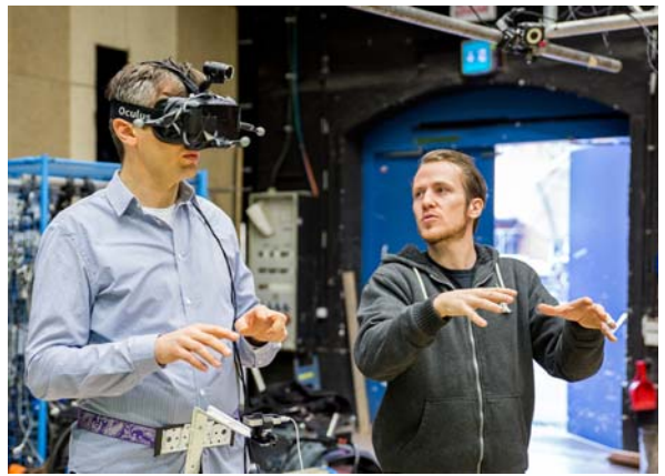
Figure 1: Evaluation of early prototype.

To solve the problem with gesture recognition, VPET builds on a user-friendly tablet interface. This allows tasks of production and post-production to happen in one logical (data) space where different technologies can be combined. VPET also provides an architecture for using a variety of real-time input and output devices.