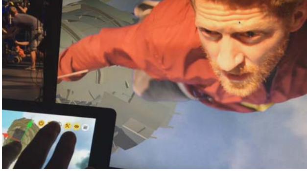
Figure 4: Evaluation during Filmakademie production, actor in flight rig in front of back projection, VPET controlling debris.

Within our project another major strand researches immersive experiences and its application in performing arts through a series of artistic installations. VPET was also successfully used in such environments.